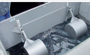
HydroStyx® discharge brake with controlled bottom outlet